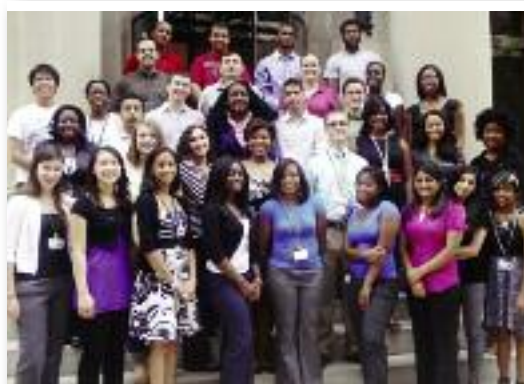
Summer Diversity Internship Program participants, Johns Hopkins University, including six students supported by AARDA

We hope that you will read this Annual Report for your own “View from the Top.” And please accept our THANK YOU for your interest in AARDA and your loyal support, past and future. You and we have done our best in 2010. Now, 2011, here we come!