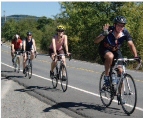
EL541 Covered Bridge Bike Tour participants travel along their Oregon route raising funds for AARDA