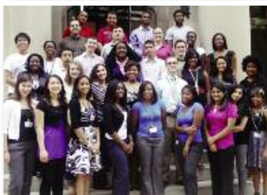
Summer Diversity Internship Program participants, Johns Hopkins University, including six students supported by AARDA

We hope that you will read this Annual Report for your own “ View from the Top .” And please accept our THANK YOU for your interest in AARDA and your loyal support, past and future. You and we have done our best in 2010. Now, 2011, here we come!