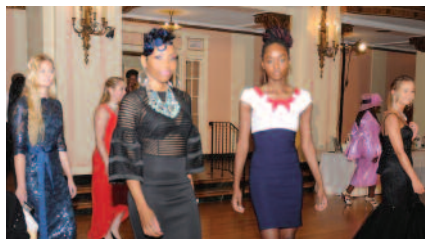
Fashions on revue at AARDA's 18th annual fund raiser, "Bound with a Common Thread," at Detroit's Masonic Temple